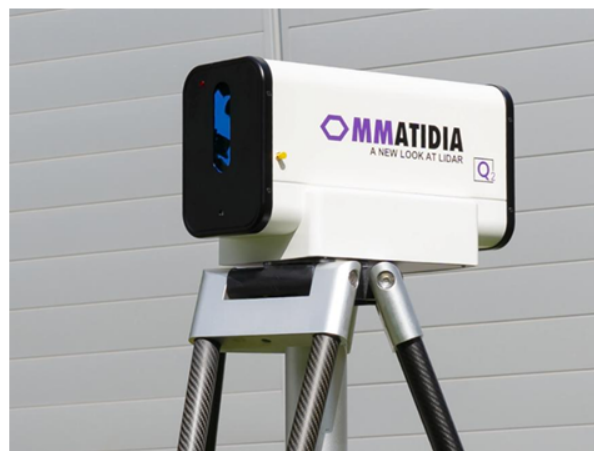
Figure 1. Ommatidia's Q2 Laser Doppler Vibrometer.

The objective of this study was to evaluate whether Ommatidia's Q2 multibeam Laser Doppler Vibrometer is capable of measuring real building vibrations remotely and without contact under ambient excitation.