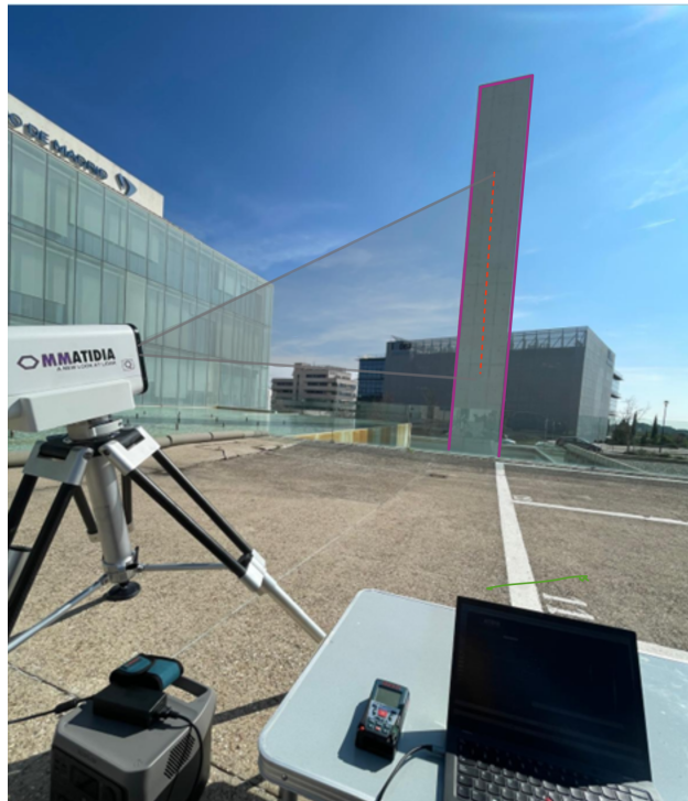
Figure 3. Experimental setup used for remote building measurement with Ommatidia Q2.

The Q2 system was positioned at an approximate distance of 25 m from the monitored structural element (geothermal heating system chimney, Figure 3). The chimney is a hollow structure made of concrete slabs with dimensions (2m x 1m x 35m). The measurement was performed on a vertical line of the building, with no artificial excitation, so that the recorded response corresponded exclusively to ambient excitation. No reflective adhesive or paint was applied on the surface of the chimney.